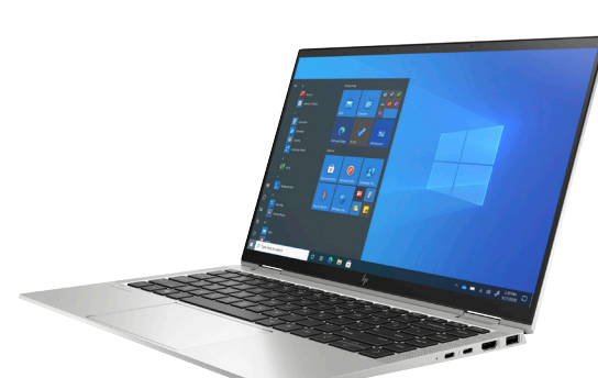
HP EliteBook x360 1040 G8

Visit here to learn more about HP EliteBook PCs