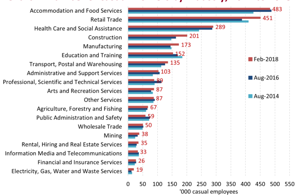
Chart 2: Number of casual workers by industry, 2014 to 2018

The number of casual workers is highest in hospitality (food and accommodation services) retail and healthcare services. Together they account for close to half of all casual workers in 2018 (chart 2).