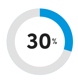
Over 30% of enterprise manufacturers plan to move to cloud-based software to manage assets and maintenance by 2022, according to a 2019 survey by IDC