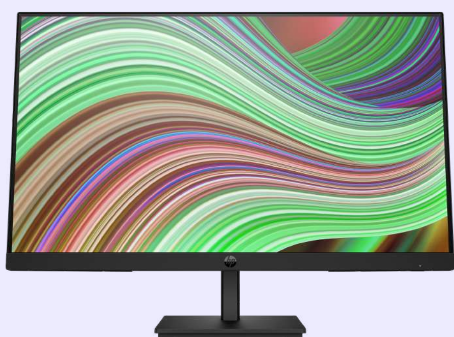
HP P24v G5 FHD Monitor (SRP: $229)

Purchase the HP EliteBook 840 G9 at $2,499 and get the following bundle at only $99!*