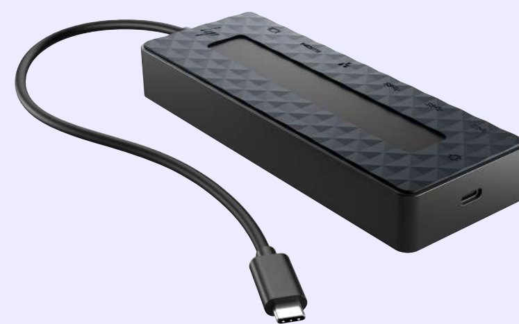
HP Universal USB-C Multiport Hub (SRP: $179)