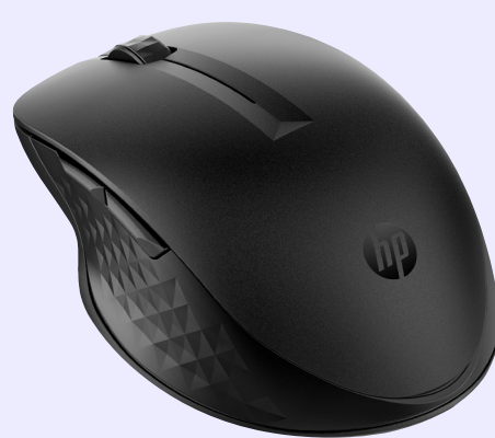
HP 435 Multi-Device Wireless Mouse (SRP: $48)