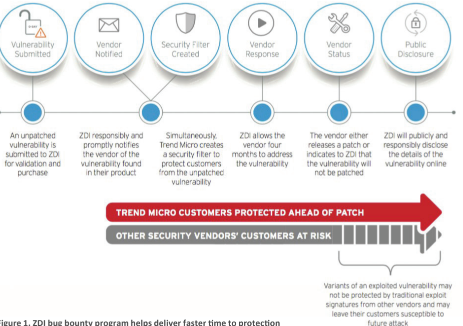
Figure 1. ZDI bug bounty program helps deliver faster time to protection

The ZDI has been the leading global organization in vulnerability research and discovery since 2007. It is a top provider of vulnerabilities to organizations like Adobe, Microsoft and the U.S. Industrial Control Systems Cyber Emergency Response Team — and it discovered 66.3 percent of all verified vulnerabilities in 2017, more than any other bug bounty program combined. Without the ZDI, many vulnerabilities would continue to remain behind closed doors or be sold to the black market and used for nefarious purposes